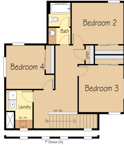
Fourth bedroom option