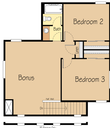
Bonus room option