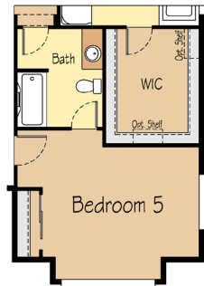
Fifth bedroom option