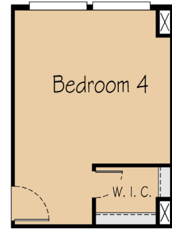
Optional 4th Bedroom