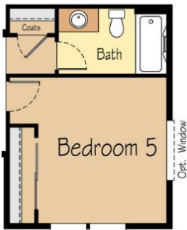
Optional 5th Bedroom