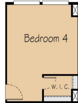
Optional 4th Bedroom